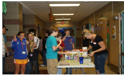
Take the time to get to know some of the people that keep us fed and keep our school clean!