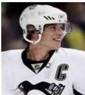
Professional Athlete of the Month: Sidney Crosby!