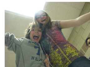
Say no to hugs?

plus it would look chaotic if everyone was hugging in the school all at once." In reality this stuff just doesn't happen. Not everyone in the school hugs all at once, I was hoping to get a better excuse than that. Also, germs can be passed my merely rubbing against someone in the hallway, which happens all the time. I don't think hugs are going to change the amount of germs transmitted at school. But that's just my opinion, you can think of it however you want.