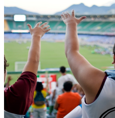
Crowds are cheering and ready to root on their favorite teams in the upcoming World Cup.

The U.S. National Team is in the tournament too. Led by team captain, Landon Donavon, the U.S. are in Group C and will face off against England, Algeria, and Slovenia. U.S. fans don't get too excited though, experts give the U.S. National team a 50/1 chance of taking home the cup.