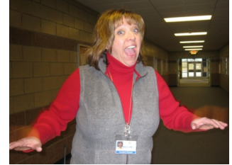
Did someone say, "Flabbergasted"?